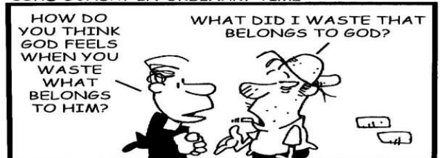
33RD SUNDAY IN ORDINARY TIME

Monday/lunes 9:00 am - 4:00 pm Tuesday/martes 9:00 am - 5:00 pm Wednesday/miércoles 9:00 am - 5:00 pm Thursday/jueves 9:00 am - 4:00 pm Friday/viernes 9:00 am - 4:00 pm